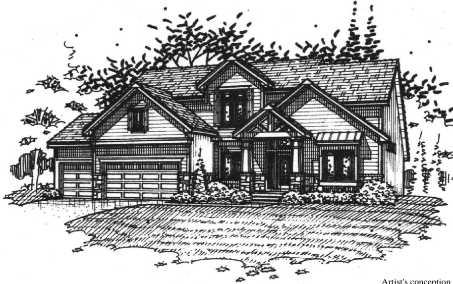
Artist's conception only.

Plan No.: CKM021 Total Sq. Ft.: 2818 Bedrooms: 4 Baths: 4